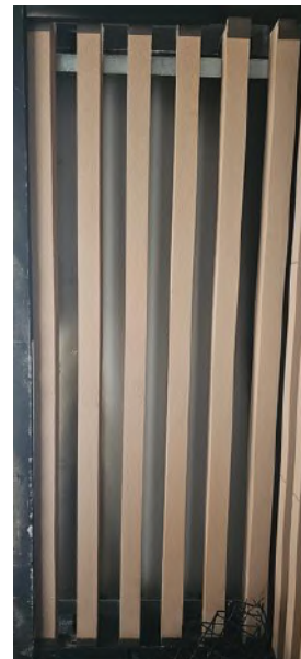
Before test (Short wing)