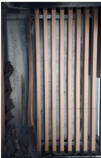
After test (Long wing)