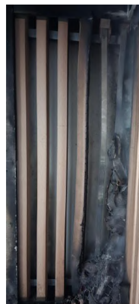
After test (Short wing)