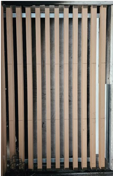
Before test (Long wing)